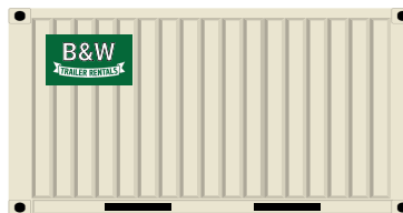
20' GROUND LEVEL STORAGE CONTAINER